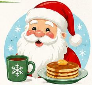
BREAKFAST WITH SANTA