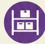
AFTER ORGANIZING (PUTTING THINGS IN THE ACTIVITY ROOM)

Our events are only possible because of the support and involvement of our residents. Without additional volunteers, the Association may not be able to continue hosting some of these community gatherings in the future.