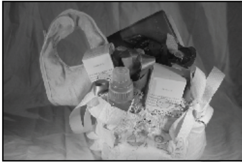
For Baby The Best Care Set - Diaper Rash Be Gone!

Individually designed gift baskets. A range of sizes and scents to choose. Personally delivered to your door. $15 and up.