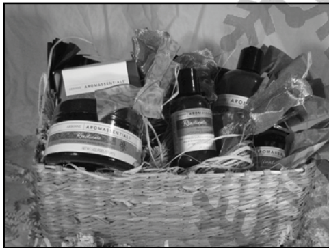
For Men Radiate - Aromatherapy Lotions