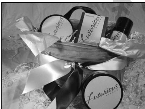
For Women Luxurious Almond - Gift Set