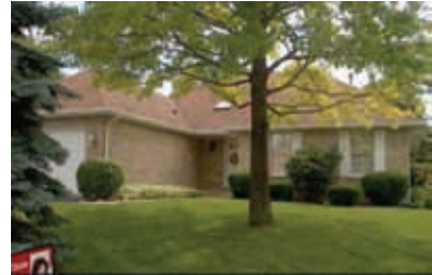
SOLD 2 Mossfield