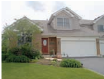
Contract Pending 222 Braeburn