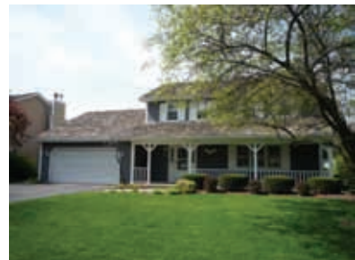
Contract Pending 26 Cedargate