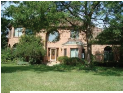
SOLD 143 N. Buckingham