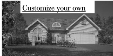
Customize your own