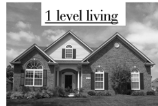
1 level living