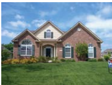
12 Winthrop New—$384,900