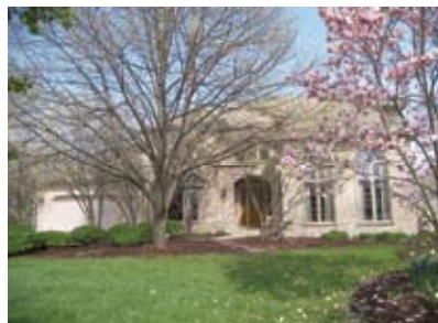
141 N. Buckingham—$639,000