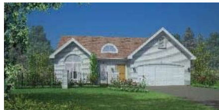
Blackberry Hill New Construction