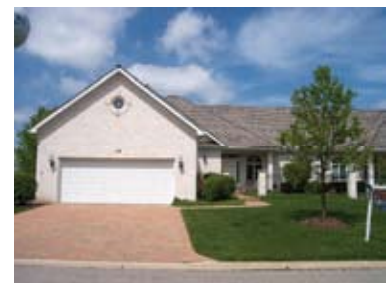
14 Penny Lane—$384,900